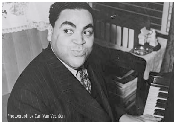
Photograph by Carl Van Vechten

In adapting the character Genie for the stage, the creative team turned to the original inspiration for the Disney animated film character: classic jazz showmen Fats Waller and Cab Calloway.